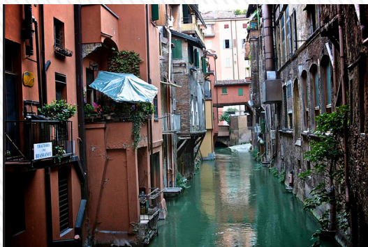
“The Little Venice”

http://www.youtube.com/watch?v=ObBreSoNzZY