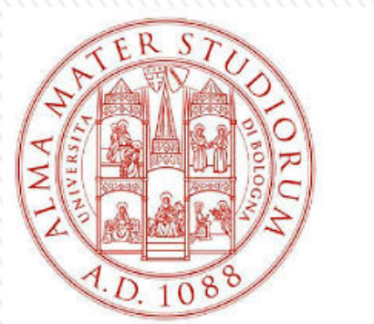
“The Oldest University”