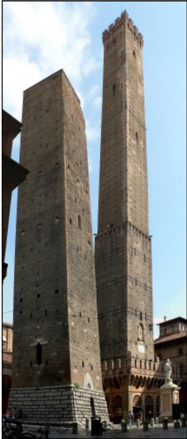
“Asinelli and Garisenda Towers”